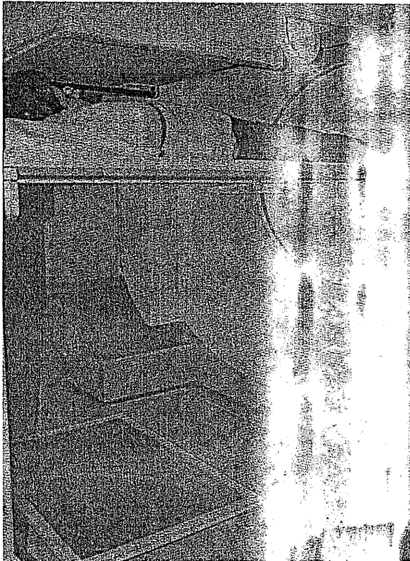
Figure 1. Planar calibration phantom used as planar flood source for body imaging in lymphoscintigraphy.